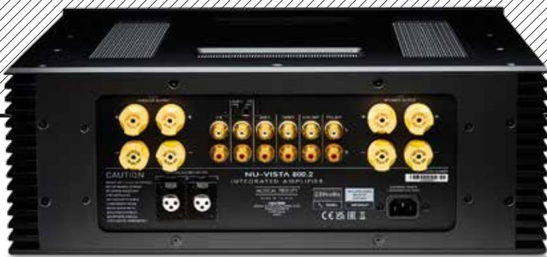
ABOVE: The Nu-Vista 800.2 has five line ins (four on RCAs, inc. an HT bypass option and one set on XLRs), plus fixed and variable outs (on RCAs). Pairs of very substantial loudspeaker cable/4mm binding posts support bi-wiring

Singles A&M Records; EVECD 1], but the amplifier effortlessly switched gear to craft a fulsome, bass-rich wave of sound, deep enough to dive into. The piano accompaniment was clear and lifelike, with the weight of each press of the keys easy to appreciate, as was the occasional cheeky stutter in Sting's otherwise uniform bassline. Such fine details aren't hidden away, but neither are they spotlighted: Musical Fidelity's new model gets the balance right between its big picture presentation and the incisive retrieval of minutiae.